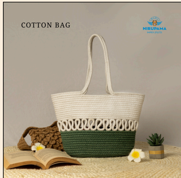
CODE : NIPL -793 Size (in inches) : 10" x 14"