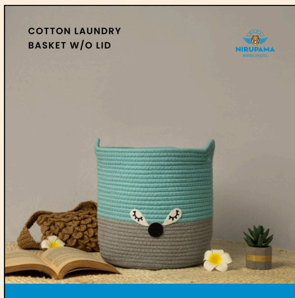
COTTON LAUNDRY BASKET W/O LID

CODE : NIPL -803 Size (in inches) : 10 "x 10 "