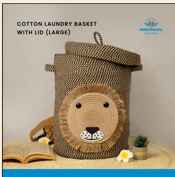
COTTON LAUNDRY BASKET WITH LID (LARGE)

CODE : NIPL -804 Size (in inches) : 10 "x 10 "