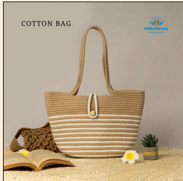
CODE : NIPL -791 Size (in inches) : 10" x 14"