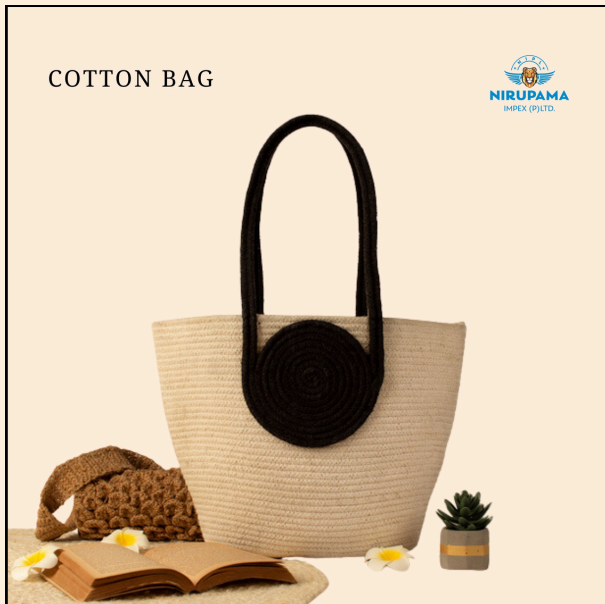
CODE : NIPL -790 Size (in inches) : 17 " x 12 "