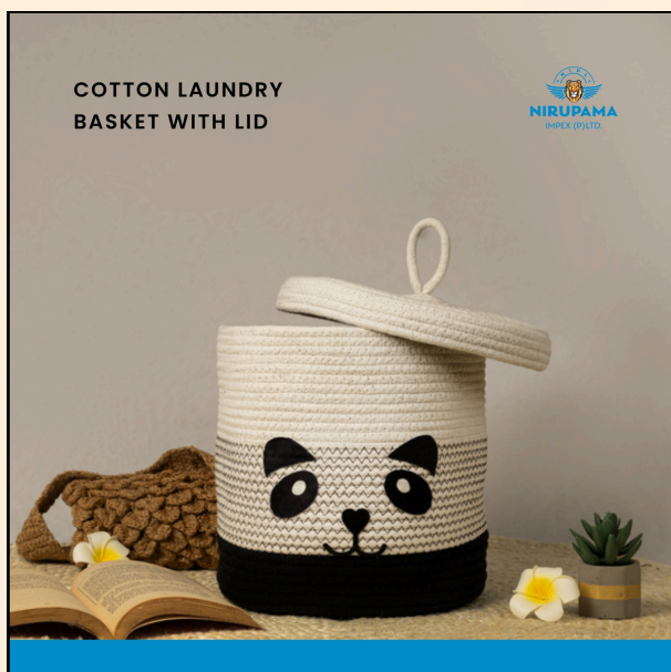
COTTON LAUNDRY BASKET WITH LID