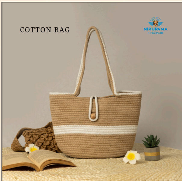
CODE : NIPL -792 Size (in inches) : 10" x 14"